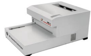
Film Digitizer FS50