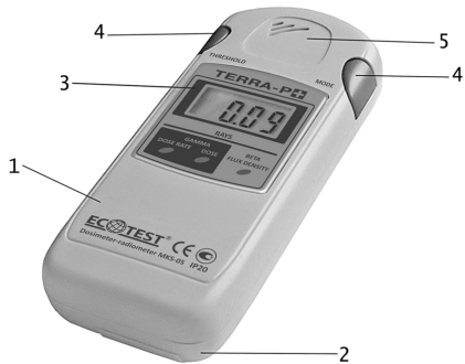
Figure 1 - Main view of the dosimeter