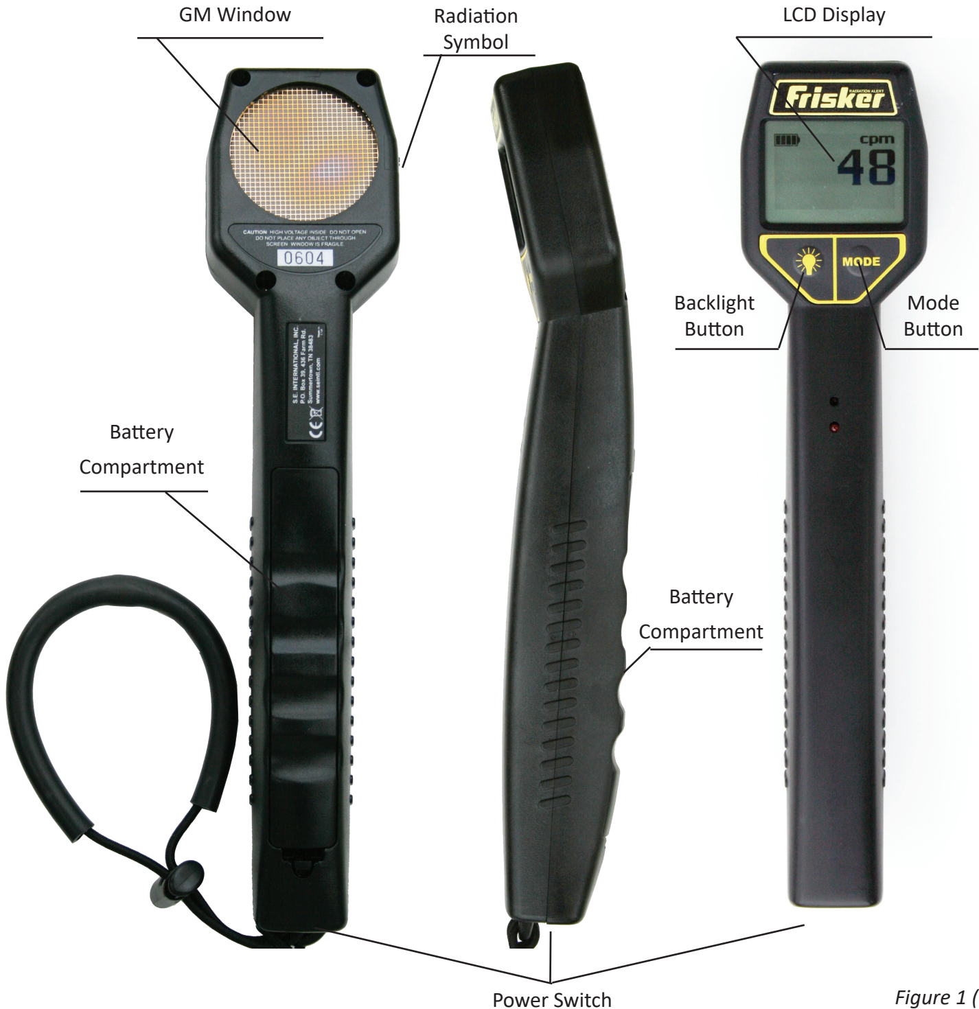
Figure 1 (1).

The Radiation Alert® Frisker uses a 2-inch, thin window Geiger tube, commonly called a “pancake tube.” The screen on the back of the Radiation Alert® Frisker is called the GM Window Figure 1(1) . It allows alpha and low-energy beta and gamma radiation, which cannot get through the plastic case, to penetrate the mica surface of the tube. The small radiation symbol on the side of the enclosure indicates the center of the Geiger tube