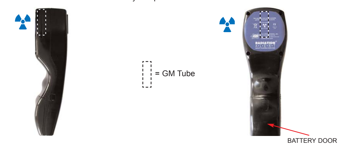
Illustration 2 MONITOR 4, 4EC, MC1K